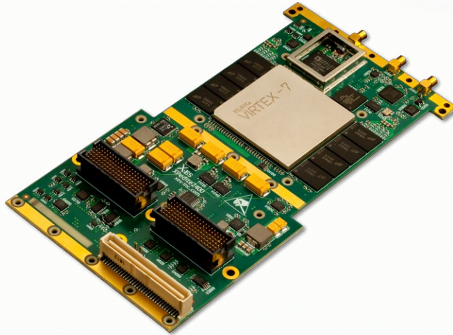
Figure 2: XPedite2400